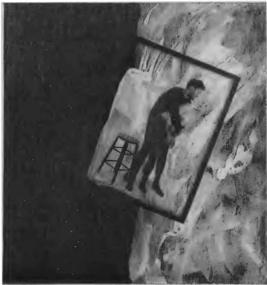
Emma Amos. Lucas' Dream. 1994. Silk collagraph, laser photograph. 74 \frac{1}{2} " x 54 \frac{1}{2} ."

images of slavery in their heads) admired in the 1920s and 1930s. Joe Louis was his hero then, and he read a lot.