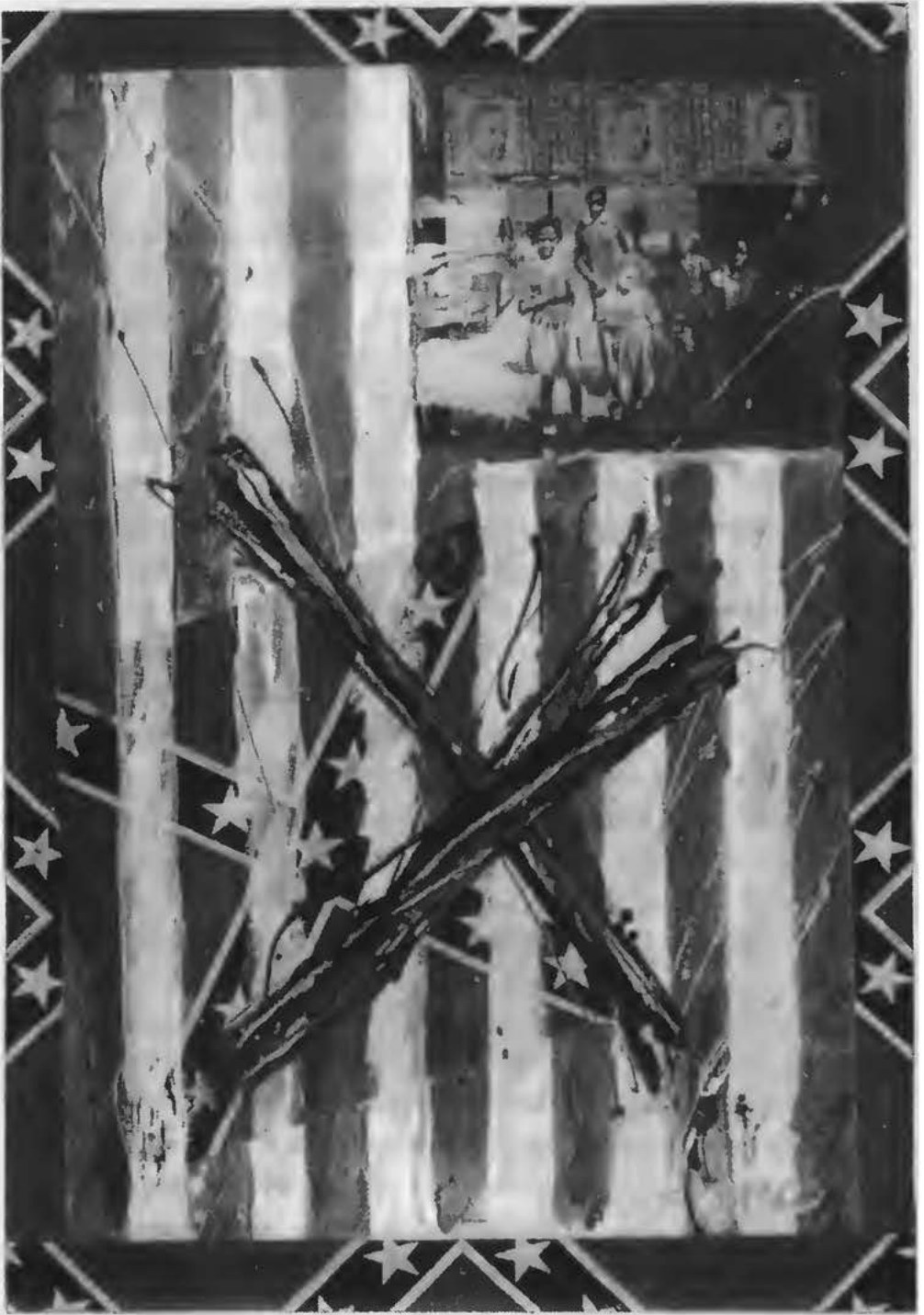
Emma Amos. X Flag. 1993. Acrylic painting, African fabric, Confederate flag, laser photo transfer. 58" x 40."

black and white figures in ways that romanticize otherness, present it always and only as that which cannot be assimilated. Against those his-