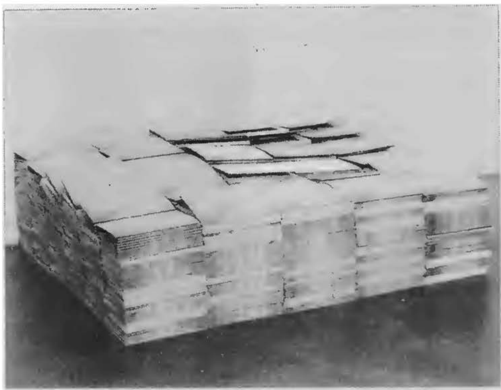
Felix Gonzalez-Torres. Untitled (Passport #11). 1993. Offset print on paper, endless copier. 8" x 31½" x 29¼." Courtesy of the Andrea Rosen Gallery and Collection Goetz, Munich.

In the stillness of this image can be heard the sounds of lives content, fulfilled. It is that aura of satisfaction which this image embraces, resurrects, bringing to life a vision of hope and possibility. The absence in this image is not meaningless death. What we see is a pedagogy of mourning that teaches us to understand that life well-lived shapes the nature of our journey, our passage from the moment we are born to the day we die. There are intimations of immortality in this and in Gonzalez-Torres's newer work, a sense of eternity that extends from this image into the artist's recent images of dark clouds where solitary birds fly. Gonzalez-Torres gives us a "passport." This passport has no places for "irrelevant" details: where we were born, in what country, dates or numbers. A passport of dark clouds, of birds in flight, moves us to a space beyond history, a space of mystery where there is no record, no documentation, nothing to recall. What is captured here is a moment of utter oneness where the experience of union, of perfect love transcends the realm of the senses. No boundaries exist. There are no limits.