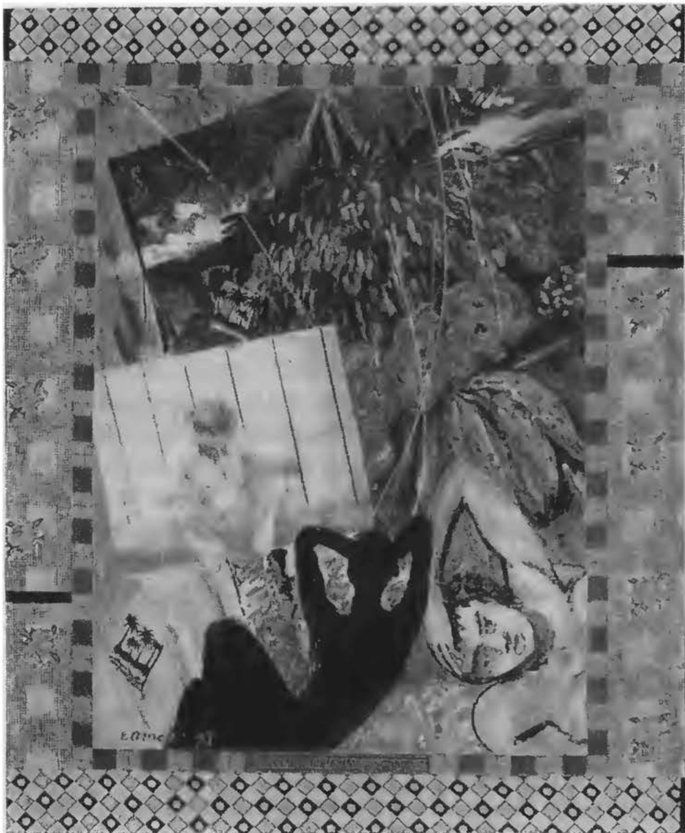
Emma Amos. Malcolm X, Morley, Matisse & Me. 1993. Acrylic/linen canvas with African Fabrics and borders.

tographs with painting is making me use a sense that I don't even quite know how to articulate. It's manipulating memory that's real, because it's painted, it's photographed. I don't know how to say it better, yet. It's tricky.