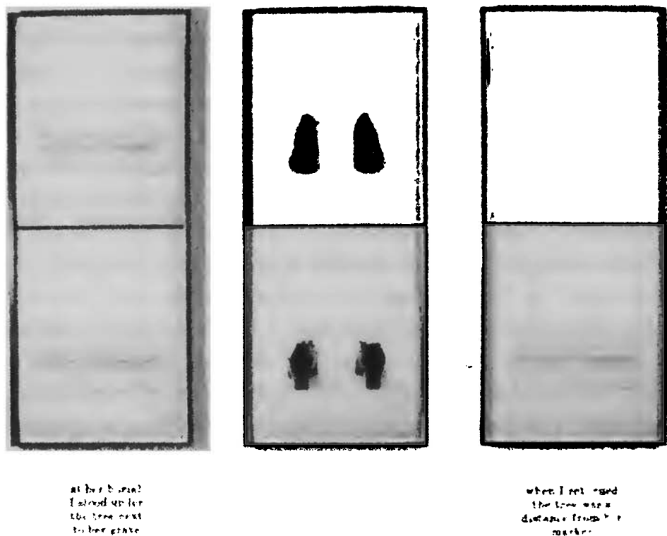
Lorna Simpson. Magdalena. 1992. Color polaroids, plastic plaques. 63'' x 78.''

Her images of black female bodies are initially striking because so many of them are not frontal images. Backs are turned, the bodies are sideways, specific body parts are highlighted—repositioned from the start in a manner that disrupts conventional ways of seeing and understanding black womanhood. This shift in focus is not simplistically calculated. The intent is that viewers look beyond the surface, ponder what lies beyond the gender and race of these subjects. Inviting us to think critically about the black female subject, Simpson positions her camera to document and convey a cultural genealogy based not on hard but on emotional realities, landscapes of the heart—a technology of the sacred. Whereas female bodies in this culture depict us as hard, low down, mean, nasty, bitchified, Simpson creates images that give poetic expression to the ethereal, the prophetic dimensions of visionary souls shrouded in flesh. Evoking traditions that honor the goddess, she depicts black women in everyday life as if our being brings elegance and grace to whatever world we inhabit. Black female bodies are black madonnas in Simp-