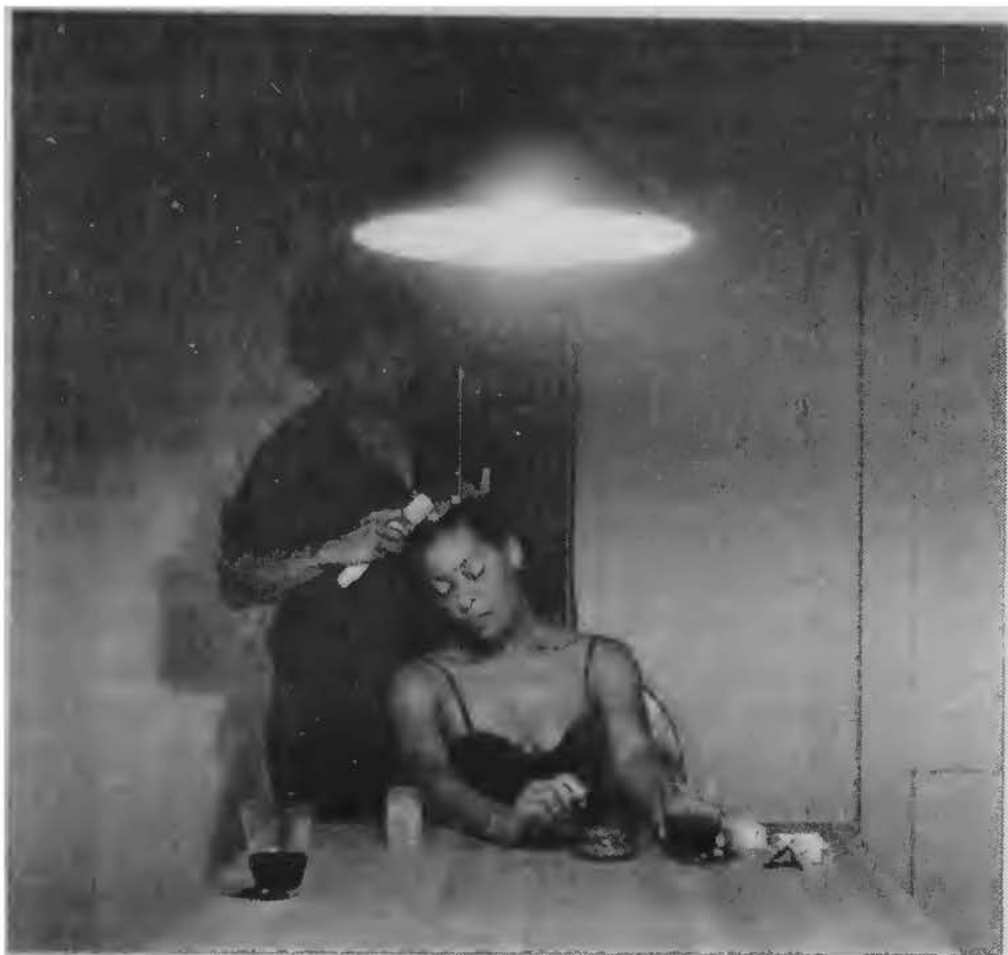
Carrie Mae Weems. Untitled. From the Kitchen Table series, 1990. Silver print. Edition of 5. 28 1 / 4 " x 28 1 / 4 ".

bb: It's there in the piece Went Looking for Africa . To me, this new work calls to mind Audre Lorde's sense of biomythography. You're not looking to "document" in some scientific, linear, orderly, factual way where we came from, how we got here; you are uncovering these details, but also exploring the gaps, the spaces in the shadows that facts don't allow us to see, the mystery.