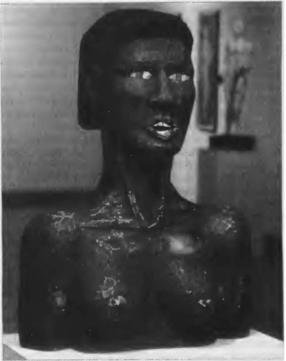
Alison Saar. Diva. 1988. Wood, tin, paint. 32" x 30" x 10." Courtesy of Jan Baum Gallery.

disrupt and challenge norms. Even when it comes to structures of domination, racism, sexism, and class boundaries, love and desire can lead folks astray, can alter what appeared to be a fixed dynamic, a set location. It is this aspect of desire that Saar captures in the piece Fear and Passion . With intense longing comes the fear and possibility of betrayal. Saar highlights the black female body precisely because within sexist and