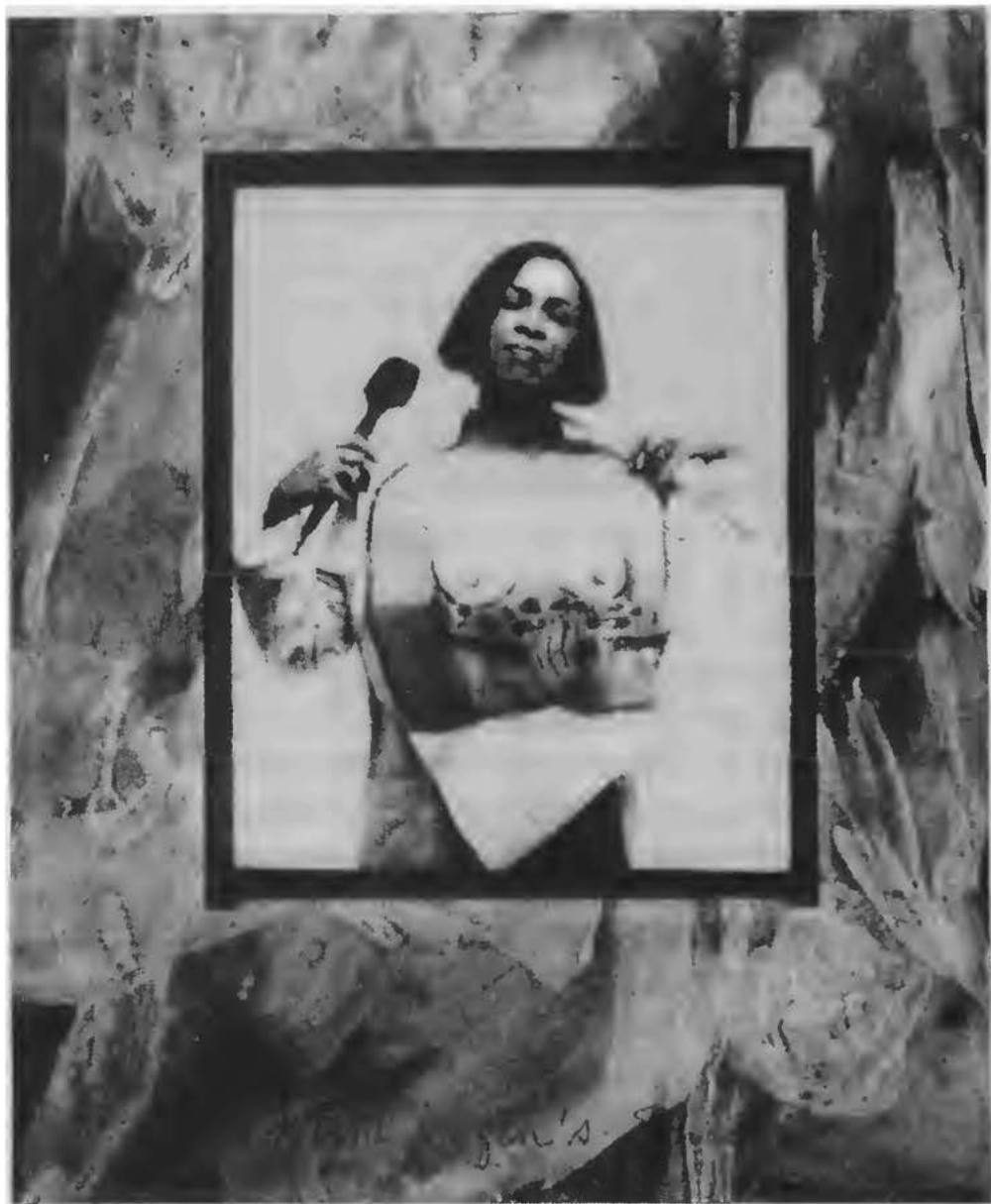
Emma Amos. Mrs. Gaugin's Shirt. 1994. Silk collpgraph, laser photograph. 12" x 9" x 2'2 1/4."

interrogates the sexism and racism that has shaped the artistic vision of many white artists, determining the ways they represent images of difference, her intent is not to censure but to illuminate through exposure. Presenting us with representations of white supremacy via her many images of the Ku Klux Klan in works such as Ghosts and Captured , she articulates the link between that whiteness which seeks to eliminate and erase all memory of darkness and that whiteness which claims the black body in