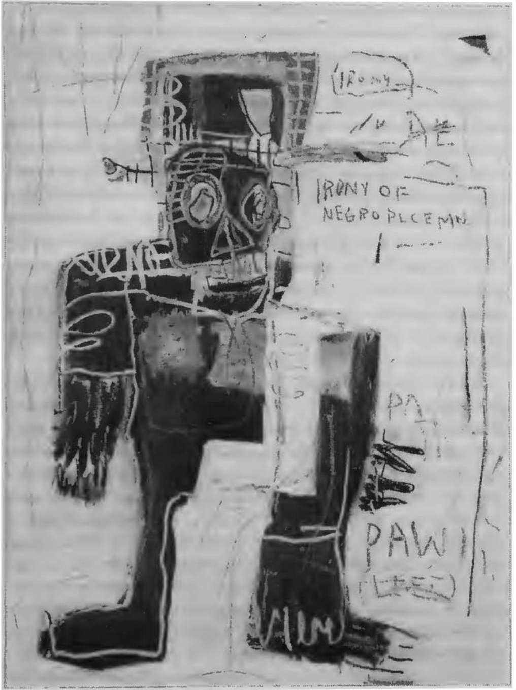
Jean-Michel Basquiat. Irony of a Negro Policeman. 1981. Acrylic and oil paintstick on wood. 72" x 48." From the collection of Dan Fauci.

Basquiat was in no way secretive about the fact that he was influenced and inspired by the work of white artists. It is the multiple other sources of inspiration and influence that are submerged, lost, when critics are