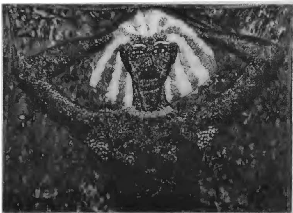
Alison Saar. Sapphire. 1986. Beads and sequins. 25" x 34."

When the ground is shaking under one's feet, fundamentalist identity politics can offer a sense of stability. The tragedy is that it deflects attention from those forms of struggle that might have a more constructive, transformative impact on black life.