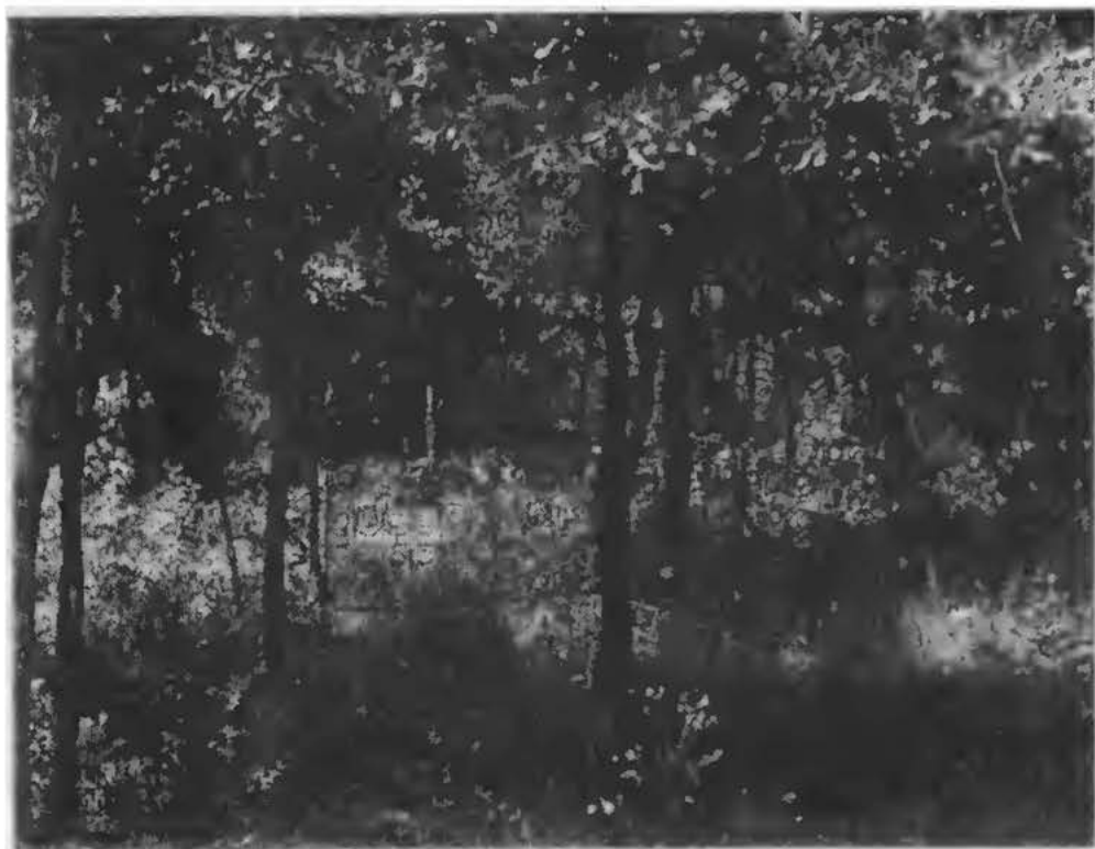
Carrie Mae Weems. Sea Island series. 1992. Silver print. Edition of 10. 20" x 20."

acknowledged to be ways of knowing that enhance our experience of life, that sweeten the journey. When Weems looks to Africa, it is to rediscover and remember an undocumented past even as she simultaneously creates a relationship forged in the concrete dailiness of the present. For example, in the Gorée Island series, captivity is evoked by the depiction of spaces that convey a spirit of containment. A cultural genealogy of loss and abandonment is recorded in the words Weems stacked on top of one another: "Congo, Ibo, Mandingo, Togo." These markers of heritage, legacy, and location in history stand in direct contrast to those words that evoke dislocation, displacement, dismemberment: "Grabbing, Snatching, Blink, And You Be Gone." Whereas the Sea Islands series marks the meeting ground between Africa and America, the Gorée Island images articulate a decolonized politics of resistance. They represent a return that counters the loss of the Middle Passage, the recovery that is made possible because of revolution and resistance, through ongoing anticolonial struggle. Weems is not attempting to create an ethnographic cartography to document diasporic black connections. Her work does not record a journey to unearth essen-