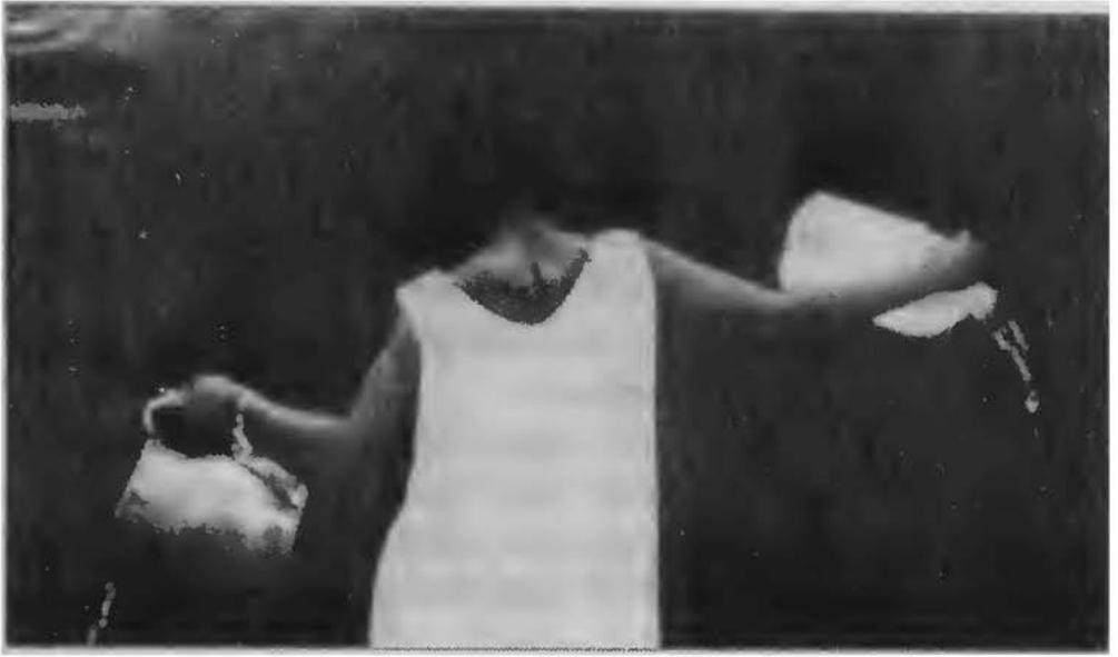
Lorna Simpson. The Waterbearer. 1986. Silver print. 40 1/2" x 70.

her subjugated knowledge speak, she creates by her own gaze an alternative space where she is both self-defining and self-determining.